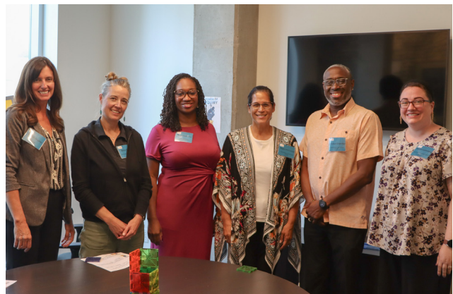
Fellows pause for a photo during a breakout session activity in September.