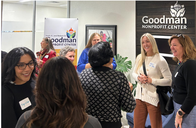
Staff, donors, nonprofit professionals, advisors, board members and more attended the Open House in November.

The Goodman Nonprofit Center is committed to regularly engaging our community to learn more about our nonprofit ecosystem, the resources that are available here and opportunities for us to bridge gaps. The following activities over the past year were especially helpful in this engagement process, raising awareness about the Center, and informing our evolving programming: