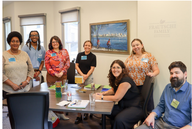
Fellows gathered at the MCF office for their first meeting in September.

Each Fellowship session focuses on a core dimension of nonprofit leadership and organizational effectiveness. Throughout these sessions, the Fellowship has been enriched by the generosity of community partners and supporters who provided space, expertise and resources to make the program possible. Below are highlights of our 2025 sessions.